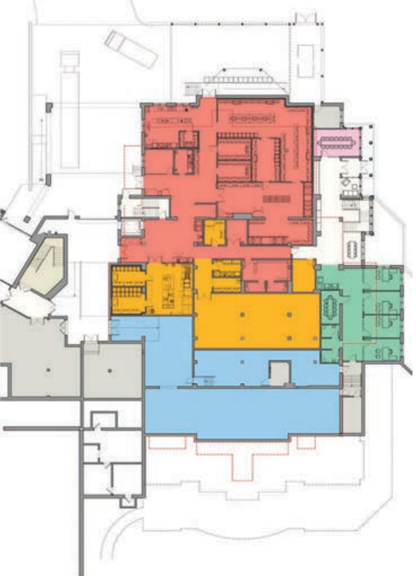
LOWER LEVEL PLAN