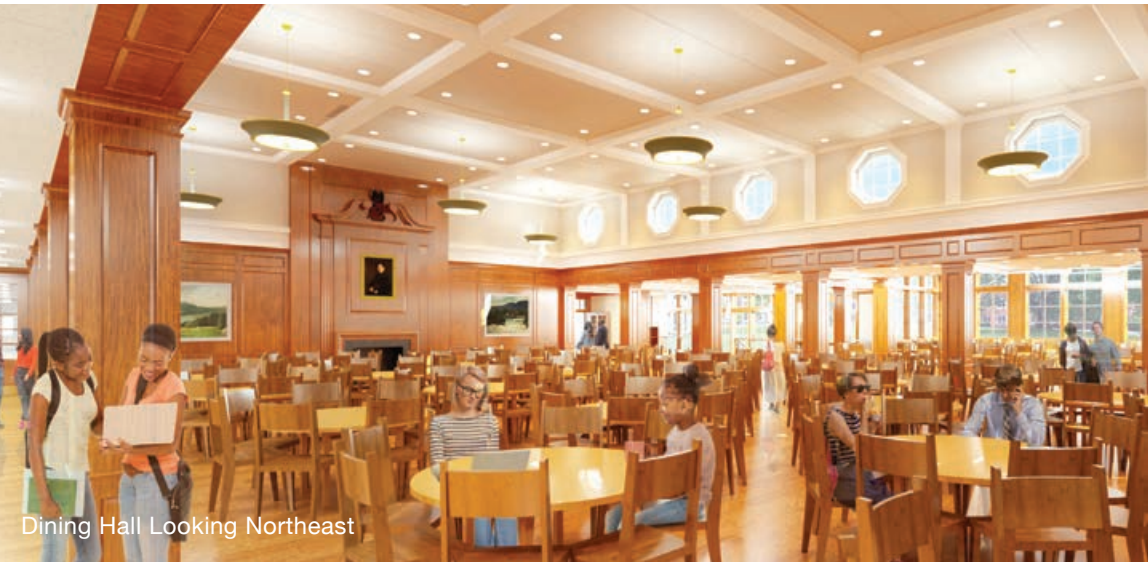
Dining Hall Looking Northeast

Please join us in making the renovation and expansion of the Dining Hall possible. Your support is a direct investment in the Hotchkiss student experience, and with your help, we will restore the Dining Hall as a pivotal gathering space.