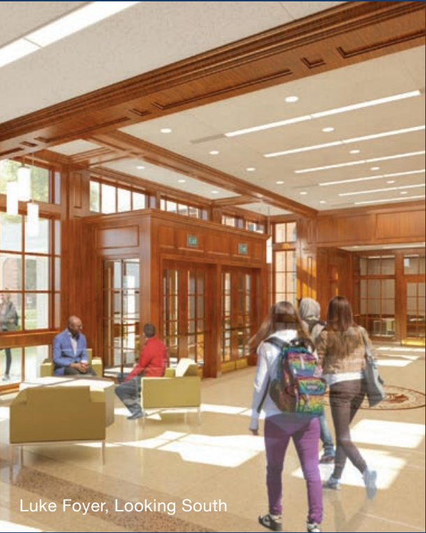
Luke Foyer, Looking South