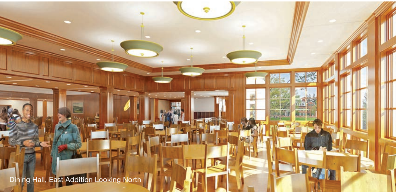
Dining Hall, East Addition Looking North

To provide a more welcoming and comfortable space for meals, conversation, and community gatherings, the Dining Hall requires a thorough renovation that will increase seating capacity to 525. The project also includes plans for a much-needed, more efficient, modern kitchen as well as changes the servery to create better pedestrian flow at peak mealtimes. We have also built in many ways to highlight the farm-to-table program and other distinctive elements of our dining philosophy.