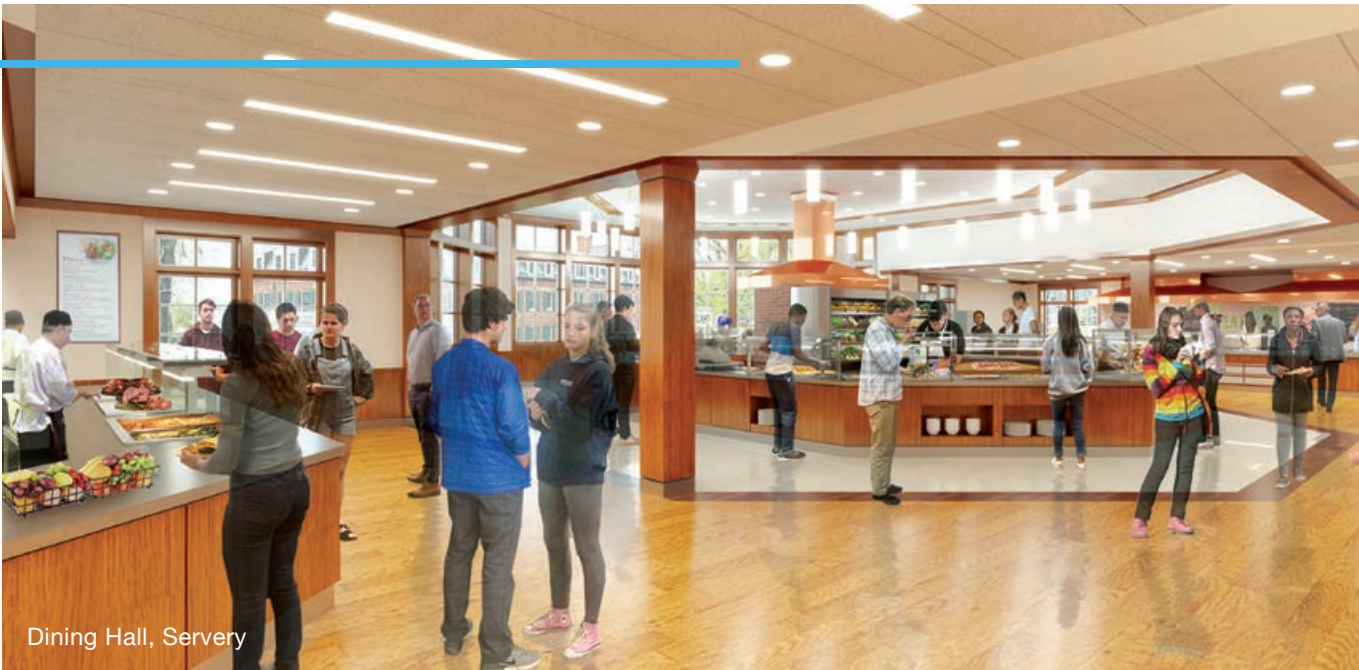
Dining Hall, Servery