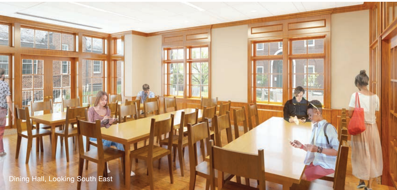
Dining Hall, Looking South East